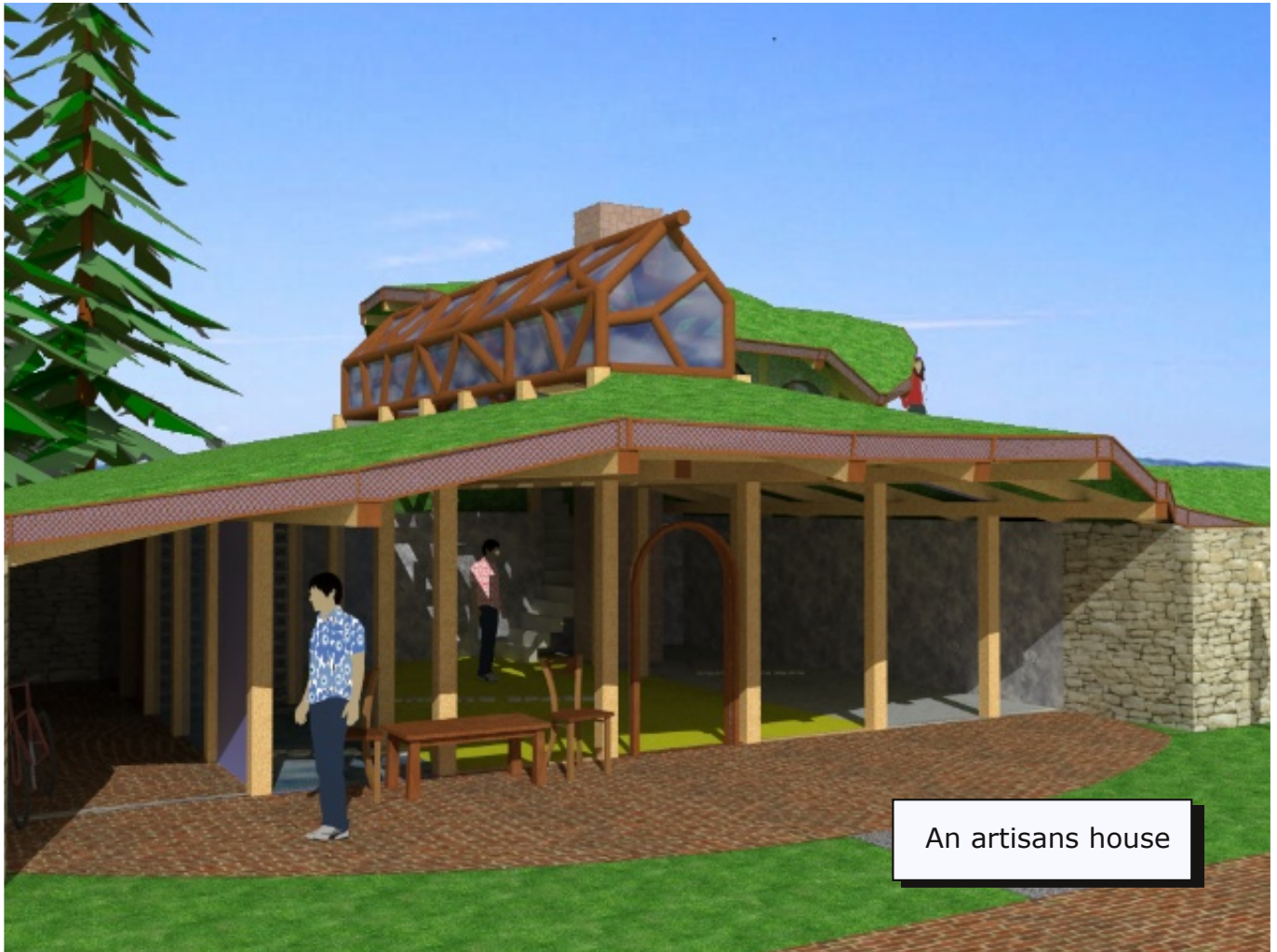
An artisans house

The artist's house is used by course instructors, visiting artists etc.