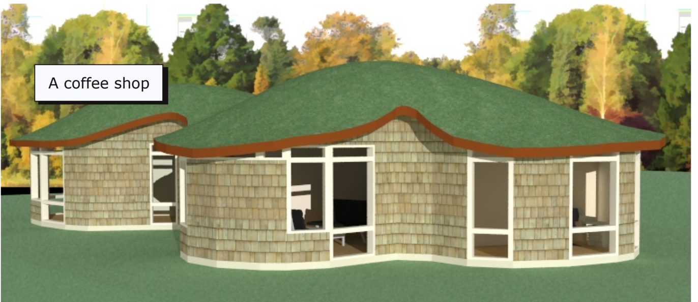
A coffee shop

The stalls come in various sizes and are made from various natural materials.